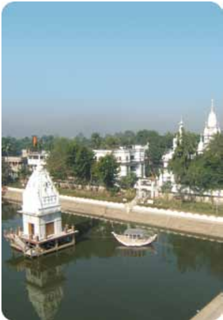
Śrī Chaitanya Sāraswat Maṭh Śrī Nabadwīp Dhām