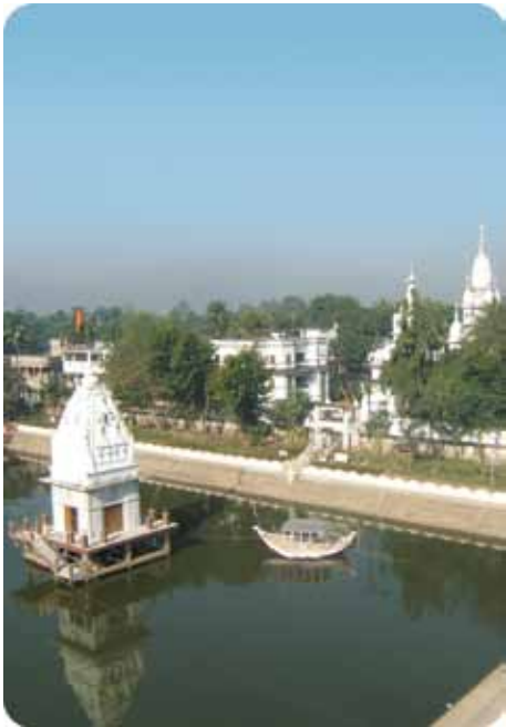
Śrī Chaitanya Sāraswat Maṭh Śrī Nabadwīp Dhām