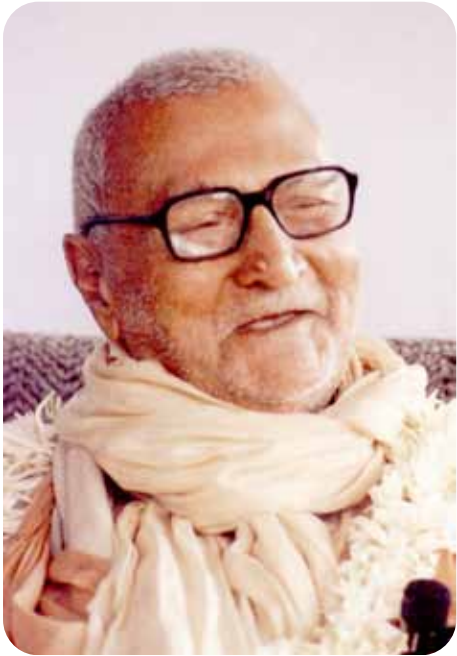
Śrīla Bhakti Rakṣak Śrīdhar Dev-Goswāmī Mahārāj